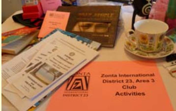
District 23, Area 3, Club Activities