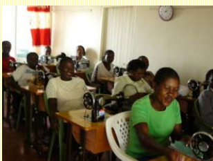
Sewing machines supplied to Nakuru Hope Family Project in Kenya