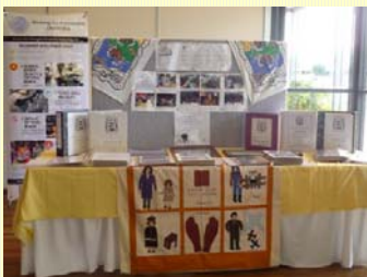
20 year history of Zonta Club of Peel