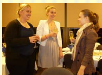
Prospective Golden Z Club members at the May dinner meeting