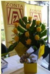
Yellow roses, a Zonta symbol of friendship